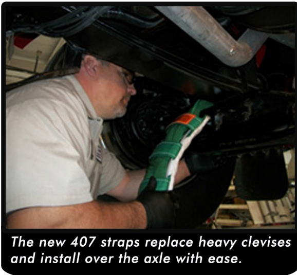
The new 407 straps replace heavy clevises and install over the axle with ease.