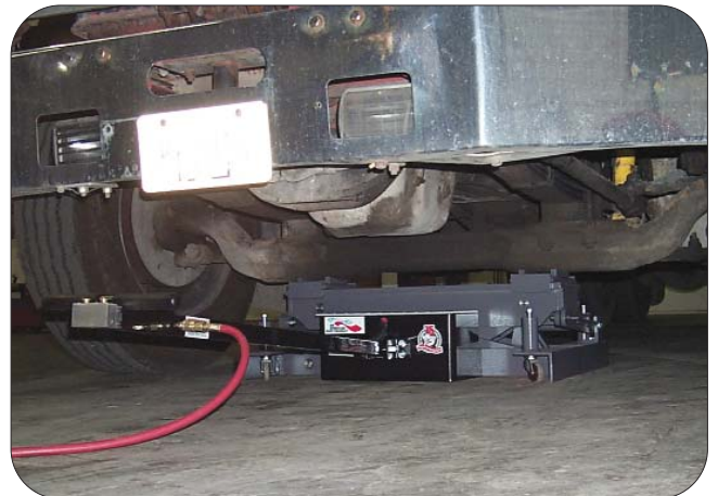
THE 7600 FLOOR JACK WITH SHORT AXLE SUPPORTS