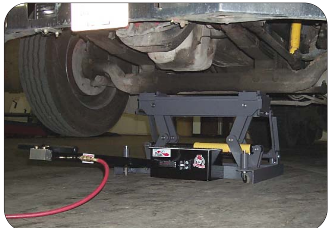
WITH THE VEHICLE RAISED, WHEEL RUNOUT CALCULATION CAN BE PERFORMED