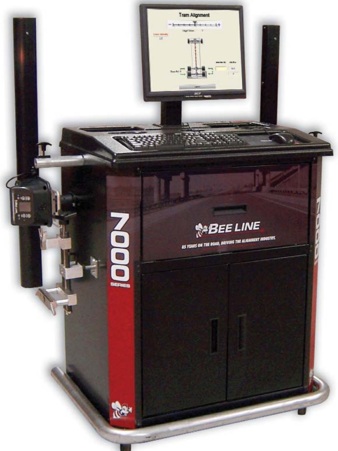
The sleek new LC7000 Series from Bee Line combines convenience with efficiency.

Comprehensive database management options give your shop the ability to save and recall any previous alignments.